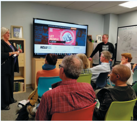
On Oct. 1, members of the Richmond People Power group met at the ACLU of Virginia's office to watch the launch of the Let People Vote campaign.

Let People Vote is a volunteer-led campaign where volunteer activists will drive change in their local communities and states, through diverse, grassroots actions. Using action plans developed by voting rights experts and experienced organizers, volunteers will contact their state representatives and elected officials, submit Letters to the Editor to their local newspapers, canvass and collect petition signatures, press their city councils to adopt local resolutions, and participate in countless other types of civic action.